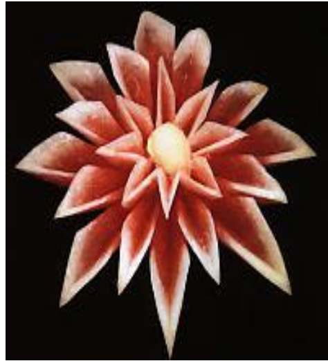
V cuts of watermelon