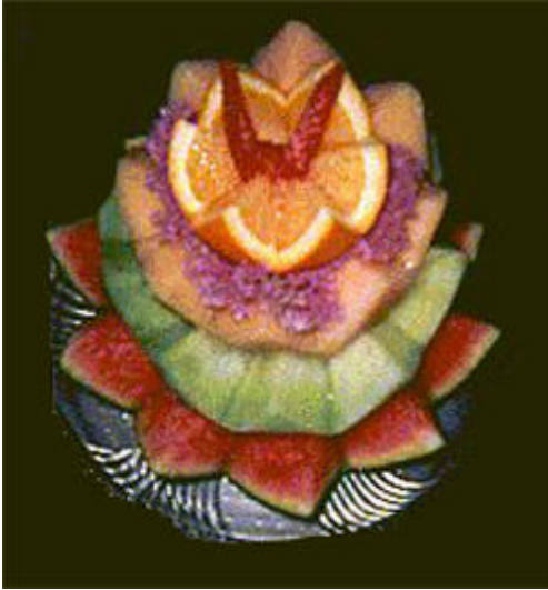
Stacked Melon Display